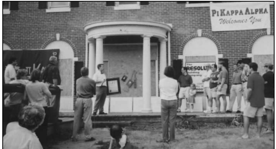
The Ground-Breaking Ceremony at the Spring Football Weekend Marked the Official Start of the Renovation Project