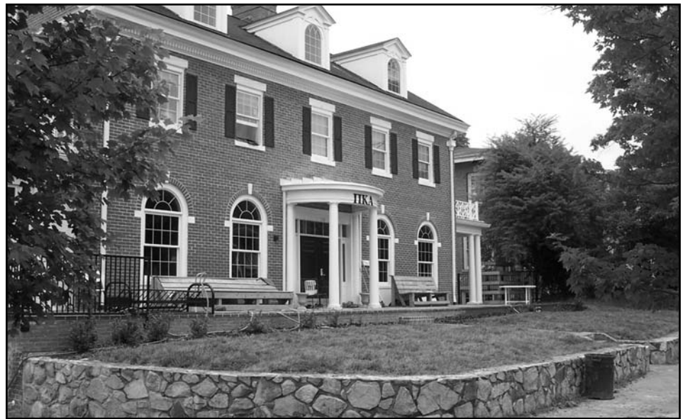
The front of the PiKa house looks terrific with its new sod.

towards our campaign goal of $1.5 million. This amount has been pledged by 399 brothers, representing more than one-third of our current alumni base. Reaching our campaign goal will only become a reality through once-in-a-lifetime gifts to Tau Chapter from alumni like you.