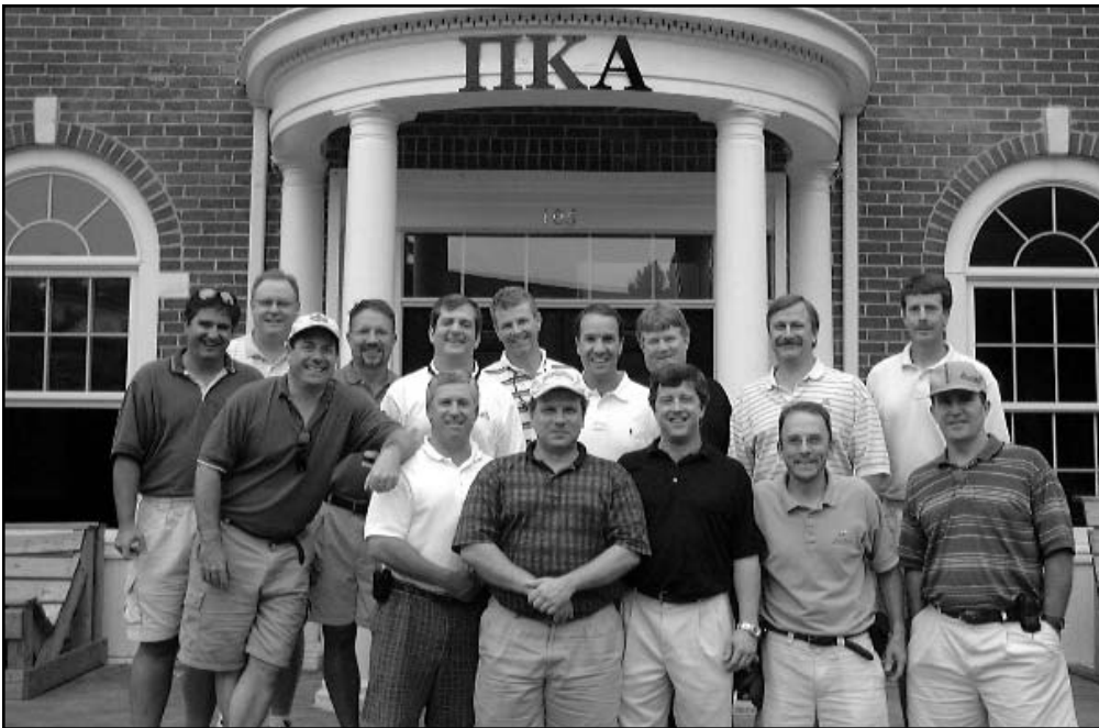
Alumni enjoying the June 12th reunion at the Pika house.