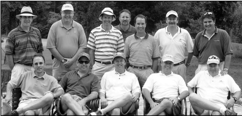
Pikas relaxing after a tough round of golf at Mill Creek.